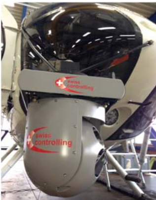
Helicopter with VarioCAM® High Definition mounted in gimbal

swiss controlling provides services for operators of electrical networks and does this with all the Swiss virtues of precision and reliability. Already small thermal problems can be precisely recognised and efficiently documented. For this job Paul Spengler and his team have found their ideal thermographic camera – the VarioCAM® HD head 880 with (1,024 x 768) infrared pixels. Like swiss controlling also this product, made in Germany, puts precision and reliability first. The high number of (1,024 x 768) infrared pixels not only precisely resolves small details but it also helps to avoid measurement errors caused by insufficient geometrical resolution. The high grade design of the camera can already be realised from the outside by little details like the use of LEMO plugs that guarantee long-lasting usage.